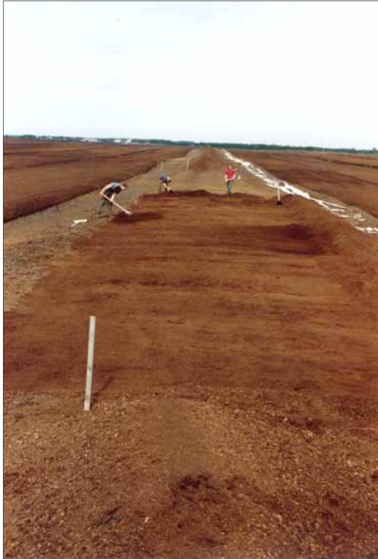
Plate 1 Investigation of find spot in Ballivor Bog (03E1221).